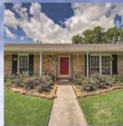
5155 Kingfisher 3/2/2 • $350's