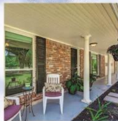
10710 Chimney Rock Rd. 3/2/2 • $260's