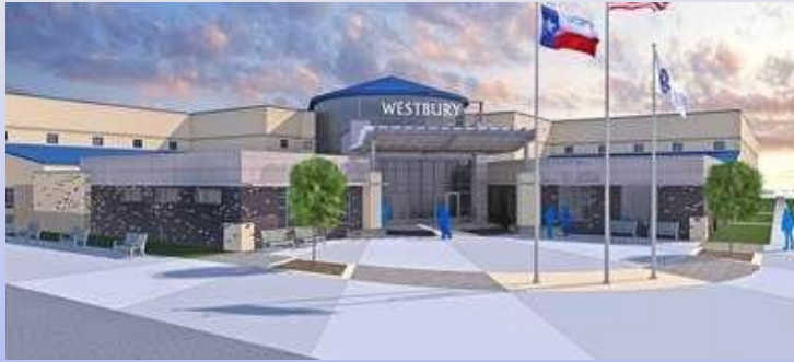
NEW projected drawings of WHS entrance

Going forward, meetings to plan the new Fine Arts wing will begin after this current phase has been completed. The HISD board approved the 9 million dollar expenditure for a new/updated Fine Arts wing at Westbury High School, and the architect fee has been approved.