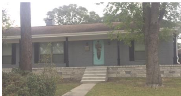
Original home located in the 100 year floodplain was elevated after Tax Day. It did NOT flood during Harvey