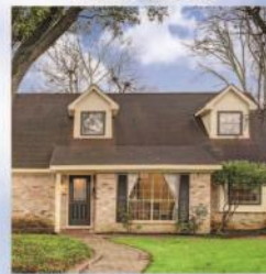
6007 Warm Springs 4/2/2 • $300's