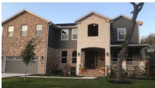
New Home Construction in Westbury in the 100 Yr Floodplain. Home was built elevated and did NOT flood during Harvey

CONTRACTORS Know and investigate your contractor. Some contractors are from out of town and unfamiliar with the City of Houston's Floodplain rules. Some contractors are pulling foundation repair permits rather than home elevation permits to avoid detailed plan review and inspections. This can be a dangerous short cut to take – it means that the home elevation project will not have a complete structural, plumbing, electrical and HVAC review or inspections. It also means that the home may not be adequately elevated or that it could be in violation of other City rules like mitigation, conveyance policy and planning department's building setback requirements for porches and ramps. Failing to work with the FMO on these home elevations could also jeopardize Increased Cost of Compliance Coverage (ICC) funding and substantial damage status release.