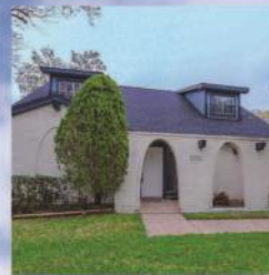
5335 W. Bellfort 4/2/2 • $250's