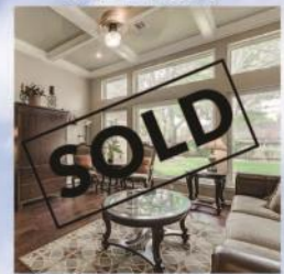
5227 Starkridge Another one SOLD!

HOUSTON • KATY • SUGAR LAND • THE WOODLANDS