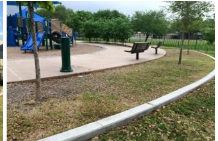
Garden area in 2015 before WCC work!

OUTSMARTING CANCER TAKES LEADING MEDICINE.