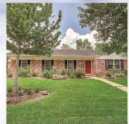
11107 Atwell 3/2/2 • $380's

Over 40 Years of Experience Selling? SOLD when you list with us!