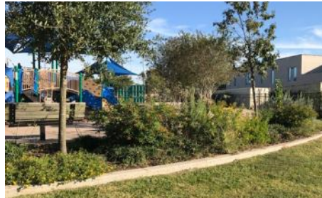
Butterfly garden in October 2017