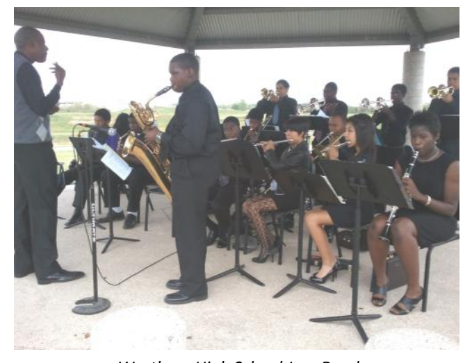
Westbury High School Jazz Band

February 19, 2012 Parker Elementary March 25, 2012 Johnston Middle School