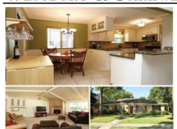
MAPLEWOOD SOUTH $307,000 6102 Bayou Bridge 4/25/2+Remodld +Granite+CustomCbnts+SSAppl+ CathedrlCeilng+RenovtdBth+DblSinks