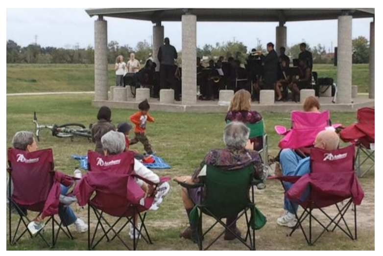
Westbury residents enjoying the music and beautiful weather