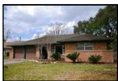
5430 Kinglet 3 bed/2 bath $169,900