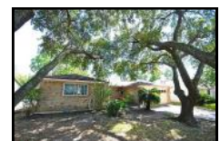
6007 Portal 3 bed/2 bath $139,900

Call us for Information on Featured Listings ♦ www.waynemurray.net