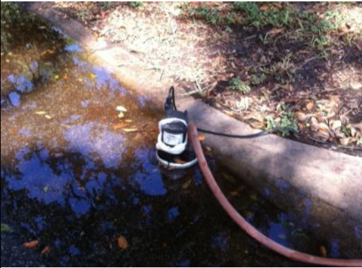
Water pump used in rain puddle by a Westbury resident

We applaud the industrious and inventive homeowners who took advantage of the broken water mains. Many hooked up pumps or used buckets to take advantage of free city water. You don't have to have a broken water main. Recently, our WCC office manager noted a homeowner using a large rain puddle at their curb to water their lawn.