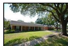
5219 Hummingbird 3bed/2 bath $224,900