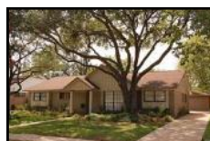
11122 Endicott 3 bed/2 bath $239,900