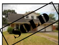
5019 Kinglet 3 bed/2 bath Another One Sold!