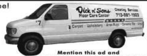
Mention this ad and receive 15% off any Cleaning Services

CARPET LAMINATE WOOD CERAMIC TILE VINYL! THERE'S JUST SOMETHING SPECIAL ABOUT A NEIGHBORHOOD FLOOR COVERING STORE....COME SEE WHY. SERVING WESTBURY FOR OVER 40 YEARS!