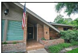
5214 Starkridge 3 bed/2 bath JUST LISTED $288,900

Area Residents & Neighborhood Specialists