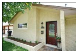
5047 Redstart 3 bed/2 bath $319,500