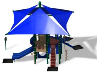
Toddler Playground (Ages 2-5)

A new Westbury Park Playground is coming soon! See the playground designs pictured below. The existing playground equipment will be demolished by the city in a few months and construction of the new playground area will begin in late 2012. City taxpayer funds will purchase and install the play equipment; however, the city does not provide shade covers similar to what has been built at the nearby Godwin Park playground (see photo on page 12). A "Friends of Westbury Greenspaces" committee has been created to raise additional funds to purchase a shade cover similar to what has been built at Godwin Park. The neighborhood around Godwin raised money to build their shade structure, and we can do it, too! Want to learn more? Continued on page 12.