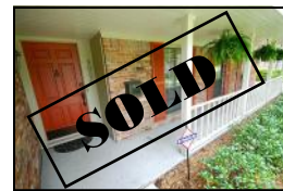
5007 Redstart 3 bed/2 bath SOLD IN 11 DAYS!