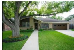
10806 Moonlight 3 bed/2 bath $239,000