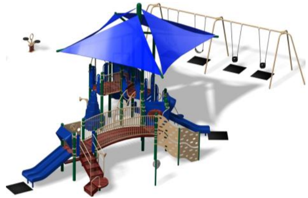
Main Playground (Ages 6-12)