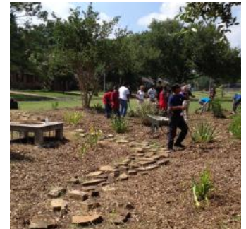
Hillcroft Rain Garden project