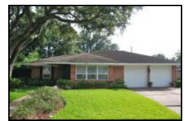
5131 Torchlight 3 bed/2 bath JUST LISTED $210,000