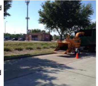
Working on Chimney Rock

The Westbury Civic Club appreciates the many residents who help keep our esplanades in good shape and who report problems to the city. The City of Houston, though it only mows every three weeks, is doing a good job with litter removal, edging and judicious use of herbicides. Take a look as you drive by and thank our great volunteers for their efforts in identifying and organizing ways to improve our Westbury esplanades.