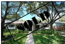
11122 Endicott 3 bed/2 bath Another One Sold!