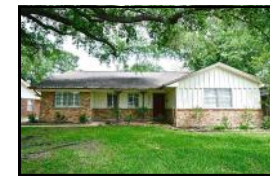
5006 Creekbend 3 bed/2 bath $229,000

Call for Information on Featured Listings ♦ www.waynemurray.net