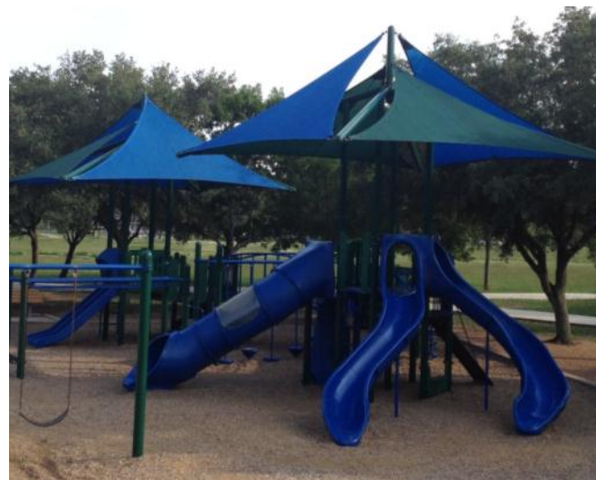
Godwin Park, example of existing shade structures above playgrounds

The annual cost is $60 per bed. Gardening training and assistance will be available for all new gardeners. Beds will be allotted based on a first-come, first-served basis – so don't delay in signing up for the waiting list.