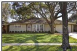
5627 McKnight New Listing!