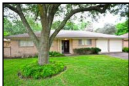
5847 Duxbury $229,500