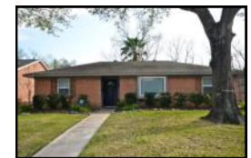
6019 Benning $319,500

“We sell more, because we do more.” Over 40 Years of Experience!!