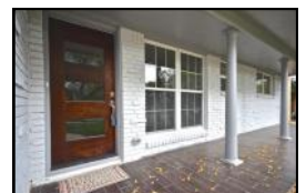
10935 Doud $337,900