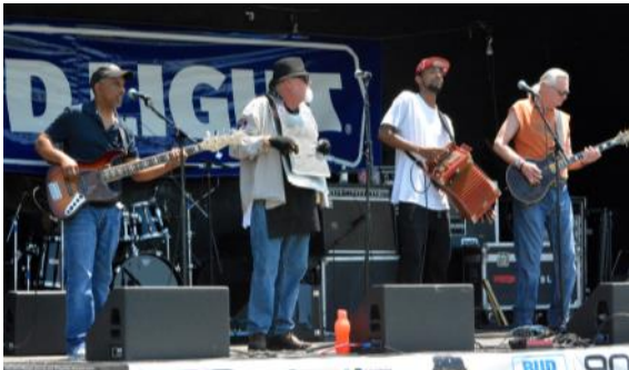
Zydeco Dots performing at Music Fest

The organizers of the 2016 Music Fest held at Willow Waterhole say: "Thank you to the amazing lineup of musicians, attendees, craft vendors, food trucks, volunteers, guest hosts, city officials, and EVERYONE who made last Saturday so fun! Please feel free to email us at willowwaterhole@gmail.com with suggestions for next year!"