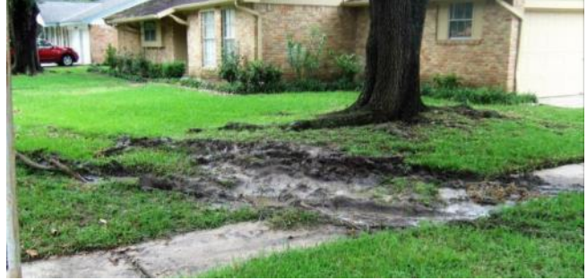
Front yard damaged due to vehicles driving thru yards

So you have a big truck and you are not worried about flooding out? Do you think it is fun to drive a vehicle through water and make big splashes? As you plowed through our interior streets,