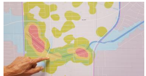
Map indicating structural flooding. Red is highest, then yellow and green.

YES. It is recommended that everyone in Harris County purchase flood insurance. Alvin, Tx, holds the record for most rainfall in a 24 hour period – an amazing 44 inches! If Westbury had gotten the 12 inches of rain that fell in the Cypress and Greenspoint areas, then the Tax Day flood would have devastated many more homes in our area. If you are not in the 100 year flood plain, it is just several hundred dollars a year.