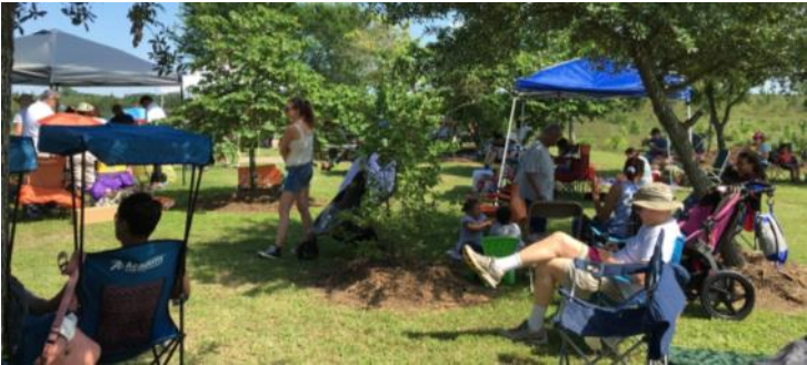
Crowd enjoying the music