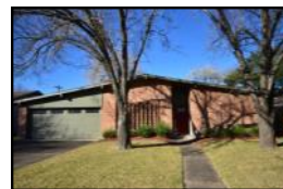
5114 Briarbend $379,900