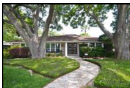
10707 Atwell New Listing!