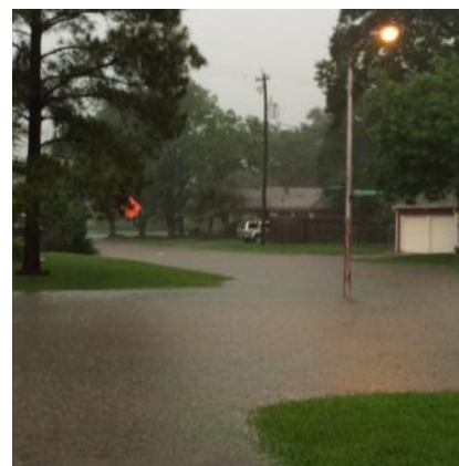
Intersection of Creekbend and Checkerboard on April 18, 2016

What about our storm drain sewers? We need new storm drain sewers. Several years ago, we ran a page in the Crier to collect flooding data from our residents. This data got us a drainage pre-engineering study, and it was determined that Westbury needed new storm drain sewers. If you attended the meeting on April 21, the city came to get public input on the new storm drain sewer project. Go to the website www.rebuildhouston.org to see the proposed projects. Public input is being taken NOW, so go online and give your input. This is a $100 million proposed project to improve Westbury storm sewers.