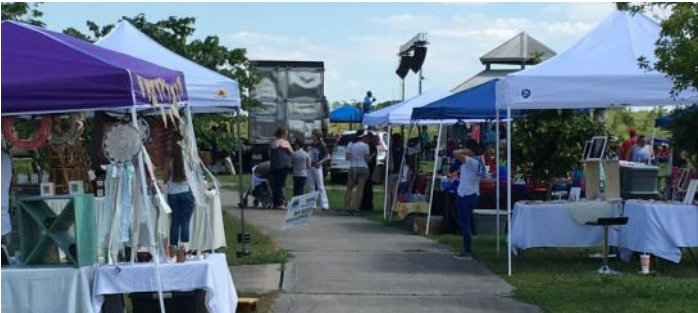
Arts & Crafts Fair