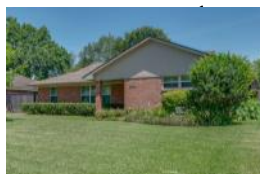
5034 Redstart New Listing!