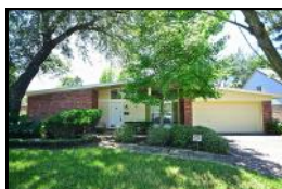
5643 W. Bellfort New Listing!