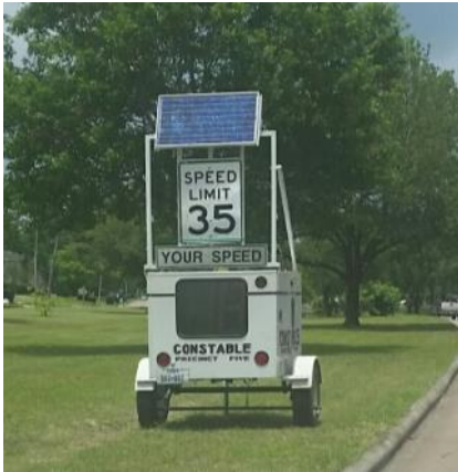
Speed Trailer on Hillcroft placed by Constables Pct 5. It will be moving around Westbury.

The Westbury Civic Club has asked HPD and Precinct 5 for assistance in helping to dissuade these heavy-footed speeders. Tickets are being issued to speeders. Precinct 5 brought one of their speed reporting trailers, and it will be moved to various locations throughout Westbury. We would like to get the reputation that speeding through Westbury is a bad and costly idea.