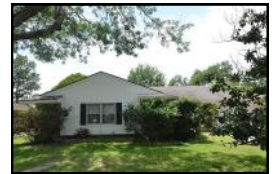
11118 Atwell Just Listed!!