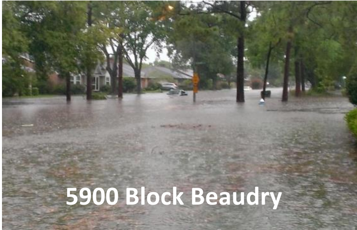
5900 Block Beaudry