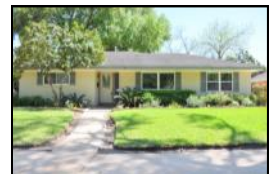
5707 Arboles Just Listed!!