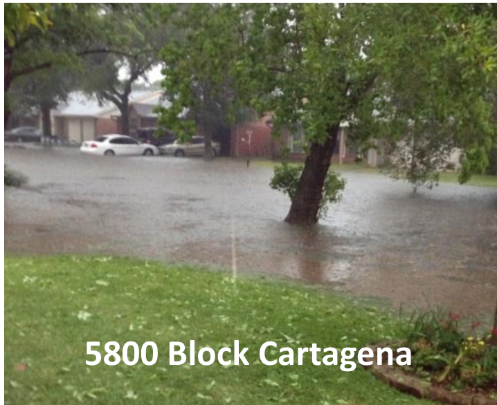
5800 Block Cartagena

Thank you to the residents who emailed the WCC office pictures of the flood. If you have any pictures of your street during the April 27 rain event, please email them to the WCC office at westburycc@sbcglobal.net