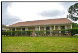
5115 Willowbend Just Listed!!