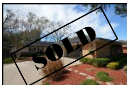
5123 Willowbend Another One Sold!!

Call for more information on featured listings!