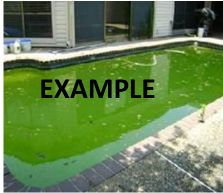
Unmaintained Pool Violation

After reporting the violation, please call the WCC office with the address so we may follow up on the report.