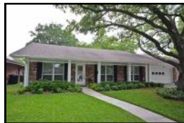
10810 Moonlight Just Listed!!