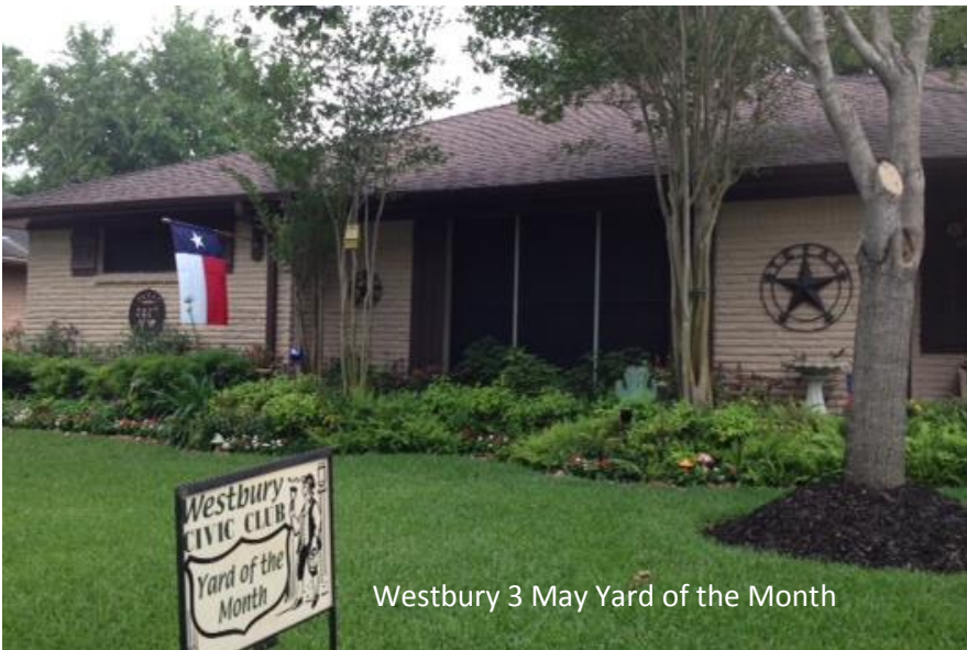
Westbury 3 May Yard of the Month