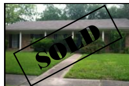
5931 Portal Another One Sold!!