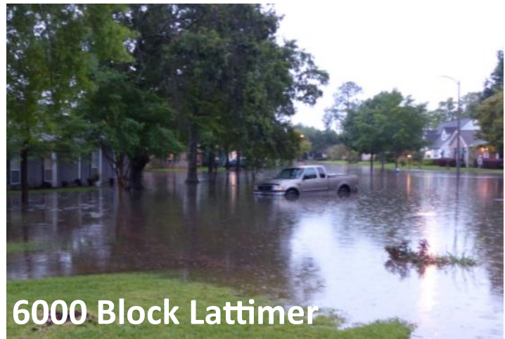
6000 Block Lattimer

Thank you to the residents who emailed the WCC office pictures of the flood. If you have any pictures of your street during the April 27 rain event, please email them to the WCC office at westburycc@sbcglobal.net