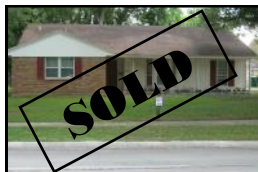
5407 Willowbend Another One Sold!!