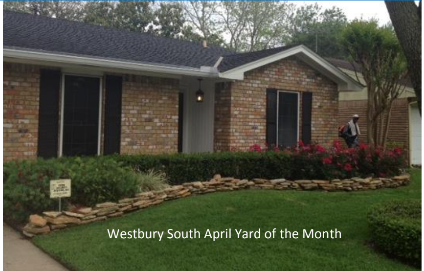
Westbury South April Yard of the Month