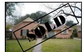
8302 Pontiac Another One Sold!!