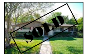
5171 Kingfisher 3 bed/2 bath Another One Sold!

Call for Information on Featured Listings ♦ www.waynemurray.net