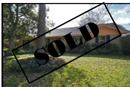
5811 Portal 3 bed/2 bath Another One Sold!