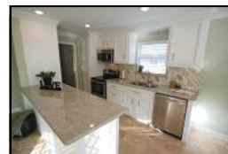
5019 Kinglet 4 bed/3 bath $259,500