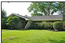
5715 McKnight 3 bed/2 bath $229,900