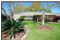
5318 Briarbend 3 bed/2 bath $259,900