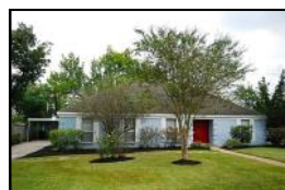
5242 Willowbend $254,500