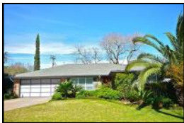
5526 Burlinghall Just Listed!!