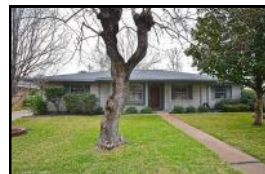
5758 Kuldell Just Listed!!