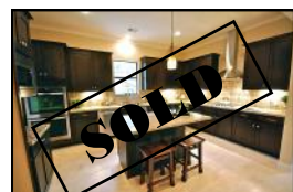
5914 Rutherglenn Another One Sold!!