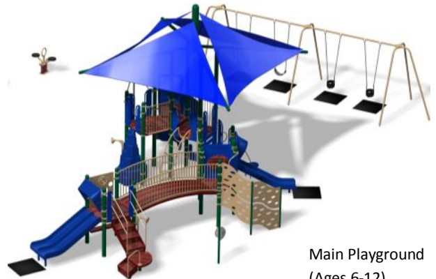
Main Playground (Ages 6-12)