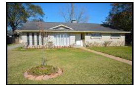
5630 Willowbend Just Listed!!