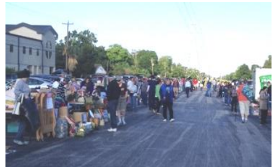
2012 Spring White Elephant Sale