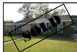
5931 Portal Another One Sold!!!