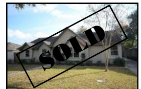
6035 Yarwell Another One Sold!!

Call for more information on featured listings!