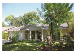
10711 Braewick 3 bed/2 bath Westbury 5 $159,900