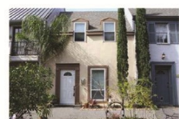
5239 Arboles #P 2 bed/2.5 bath Westbury Gardens $69,900

Call (713) 728-2300 for Information Regarding these Featured Listings in Your Neighborhood