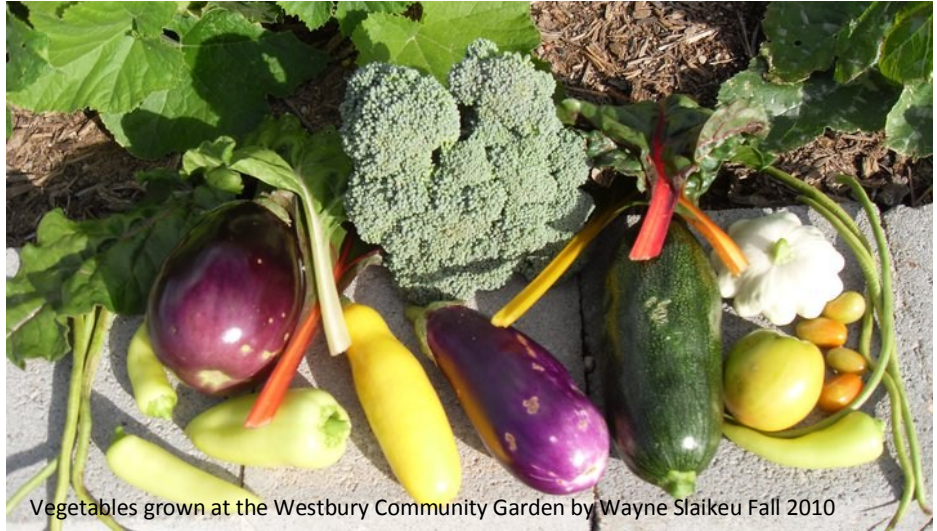
Vegetables grown at the Westbury Community Garden by Wayne Slaikeu Fall 2010