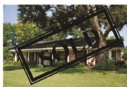
10723 Landsdowne 4 bed/2 bath Parkwest 2 Another One Sold!