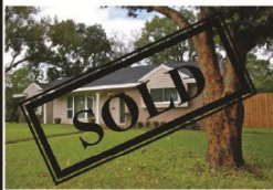
5638 W. Belfort 3 bed/2 bath Westbury 5 Another One Sold!