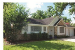
5135 W Belfort 3 bed/2 bath Westbury 1 $159,000