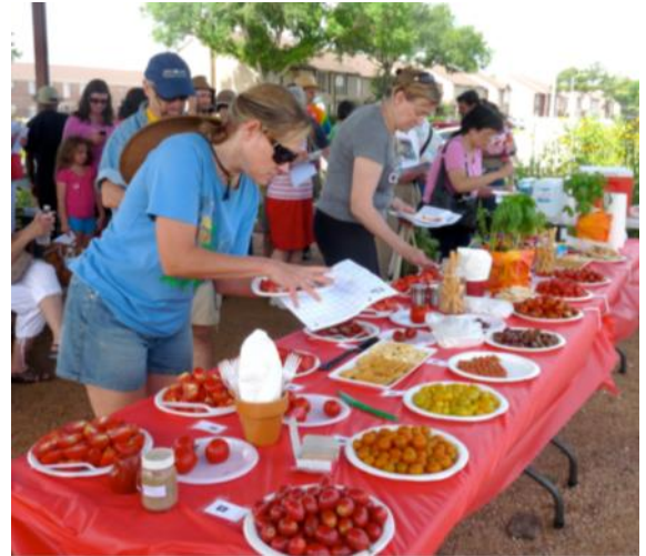
Annual tomato tasting at the WCG held each Fall.