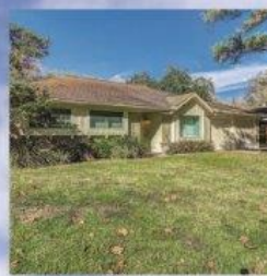
11414 Braewick 4/2/2 • $190's