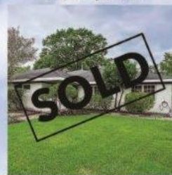
6035 McKnight 3/2/2 • $170's

HOUSTON • KATY • SUGAR LAND • THE WOODLANDS