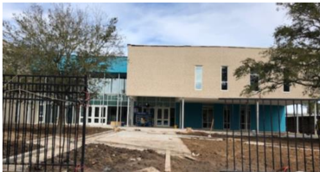
New Parker entrance along Stillbrooke is almost complete

Once again, the scheduled date to move into the new Parker Elementary Building has been delayed. The newest plan is for the move to be done during the HISD Spring Break vacation, March 12-16, instead of in February. Fingers crossed!