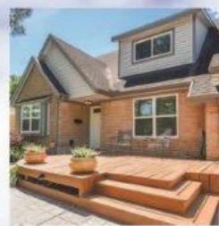
11722 Braewick 3/2/2 • $290's

Over 40 Years of Experience Selling? SOLD when you list with us!