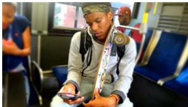
Today Society