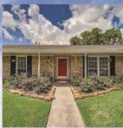
5155 Kingfisher 3/2/2 • $290's