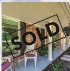
10710 Chimney Rock Rd. 3/2/2 • $260's