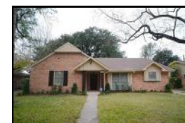
8302 Pontiac Just Listed!