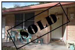
6002 Ettrick Another One Sold!!