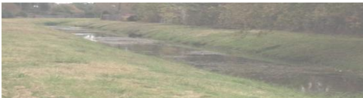
Ditch just East of Braewick before Hillcroft

If you live near or walk the banks of any of our waterways and notice anything of concern please let the WCC know.