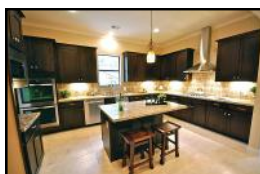
5914 Rutherglenn $419,500