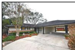
5123 Willowbend $269,500