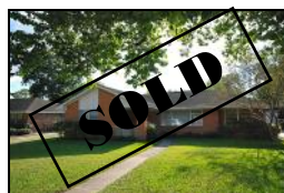
5223 Kinglet Another One Sold