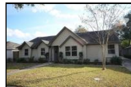
6035 Yarwell $264,900

Call for more information on featured listings!