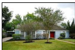
5242 Willowbend $254,500