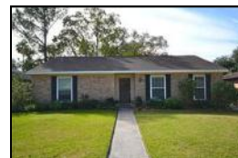
5931 Portal $177,500