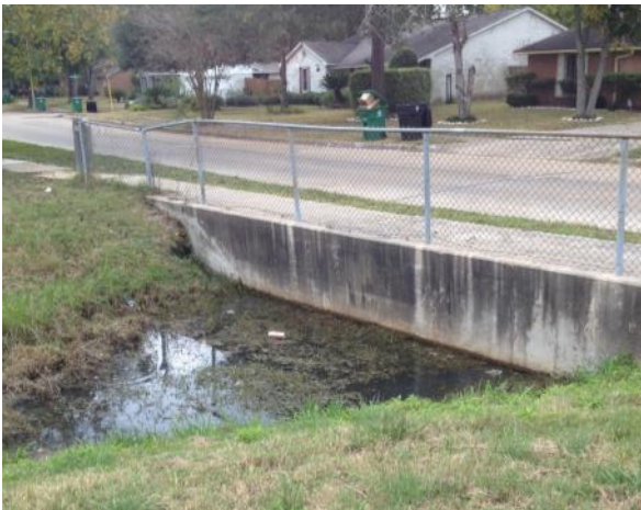
Ditch Along Braewick near dance studio