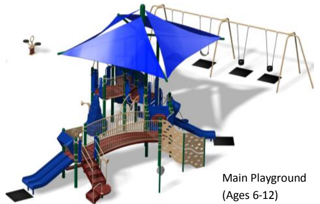
Main Playground (Ages 6-12)