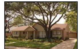
11122 Endicott 3 bed/2 bath

Call us Information on Featured Listings ♦ www.waynemurray.net