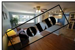
5219 Hummingbird 3 bed/2 bath