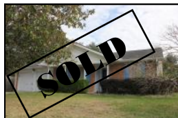
11907 Rampart 3 bed/2 bath