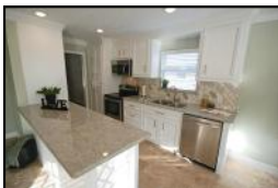
5019 Kinglet 4 bed/3 bath