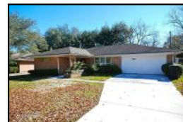
5647 Cartagent 3 bed/2 bath