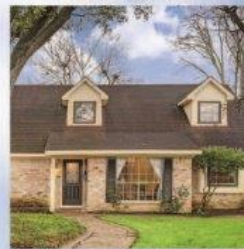
6007 Warm Springs 4/2/2 • $300's