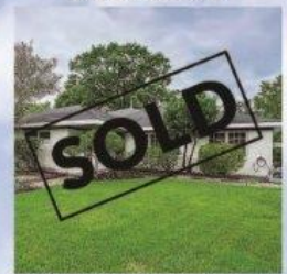
6035 McKnight 3/2/2 • $170's

HOUSTON • KATY • SUGAR LAND • THE WOODLANDS