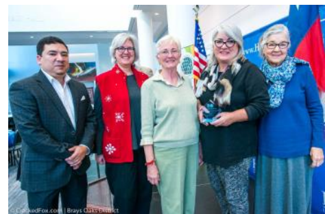
Congratulations Westbury Community Garden