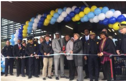
Ribbon cutting at new HPD station