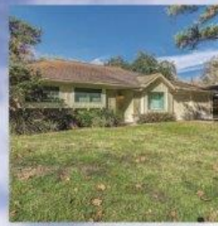
11414 Braewick 4/2/2 • $190's