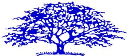
Westbury Civic Club , Inc.

For $28 a month, this Westbury Civic Club membership is a bargain and a great way for you to invest in the neighborhood. Won't you join us in making Westbury the very best neighborhood that it can be?