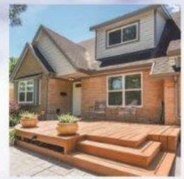
11722 Braewick 3/2/2 • $290's

Over 40 Years of Experience Selling? SOLD when you list with us!