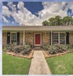
5155 Kingfisher 3/2/2 • $290's