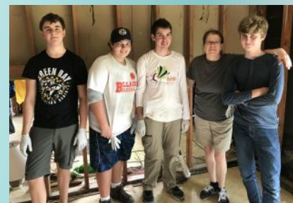
Hurricane Harvey Helpers

The true heart of Houston was shining in Westbury and I couldn't be happier living anywhere else! It's been said before, but cannot be said enough times, neighbors are what make a community and the best are located right here in Houston!