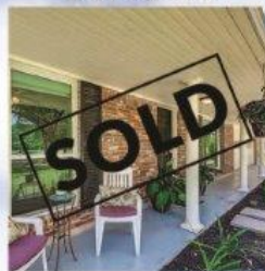
10710 Chimney Rock Rd. 3/2/2 • $260's