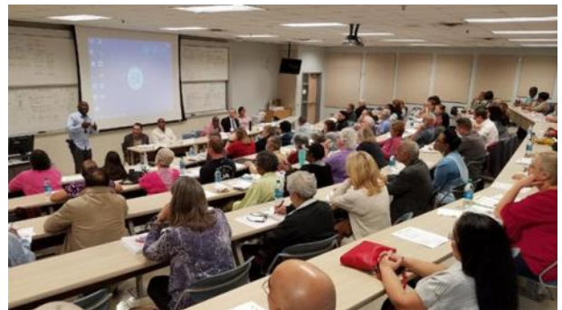
Neighborhood 101 on home repair fraud and scams after Harvey

This workshop was held at Westbury High School Lecture Hall with over 85 attendees. The workshop addressed how to deal with home repair contractors; how to find, hire, work with and pay contractors; what should and should not be in your contract, the building permit process, how to set up payment schedules, insurance issues you may not know about, how to deal with problems that may arise, change orders, and lien releases.