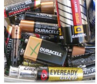
Items that can be taken to the Environmental Service Center