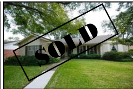
5635 Wigton 3 bed/2 bath Another One Sold!