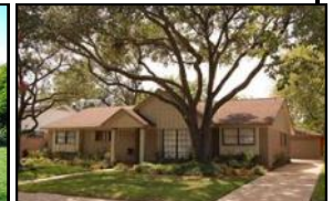
11122 Endicott 3 bed/2 bath $229,000

Call us Information on Featured Listings ♦ www.waynemurray.net