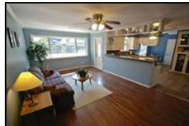
5219 Hummingbird 3 bed/2 bath $219,900