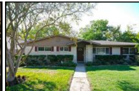
5171 Kingfisher 3 bed/2 bath $265,900