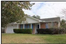
51197 Rampart 3 bed/2 bath $99,500

Westbury, Parkwest, and surrounding areas